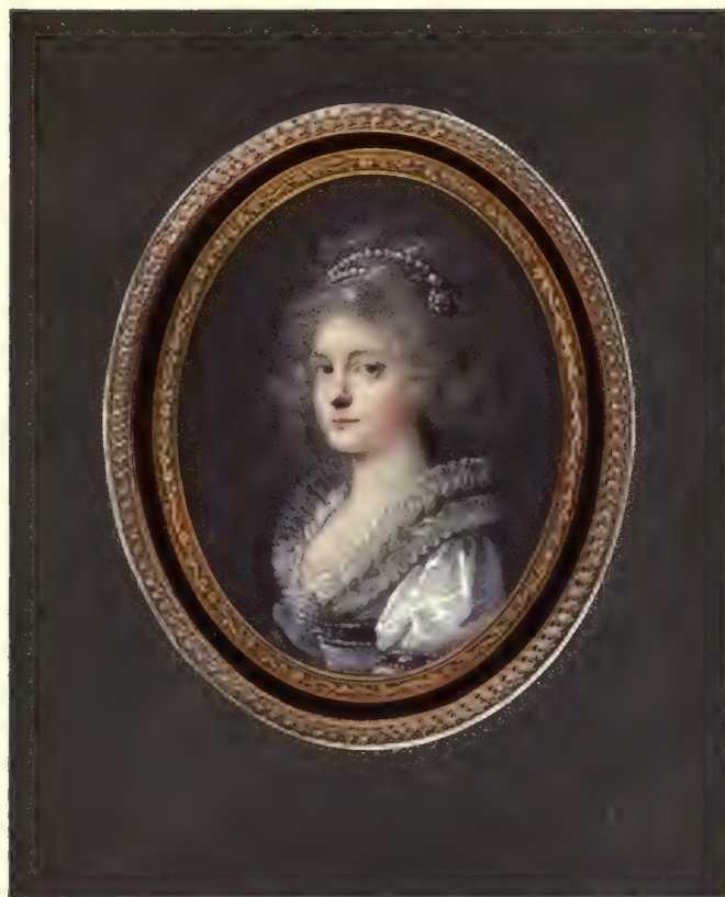
PORTRAIT OF A LADY—NAME UNKNOWN BY HEINRICH FRIEDRICH FÜGER (CIRCA 1790)